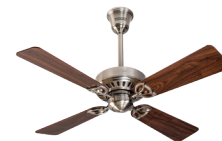
Brushed Nickel with Walnut Blades