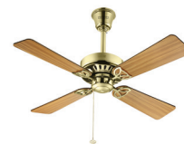
Bright Brass with Oak Blades