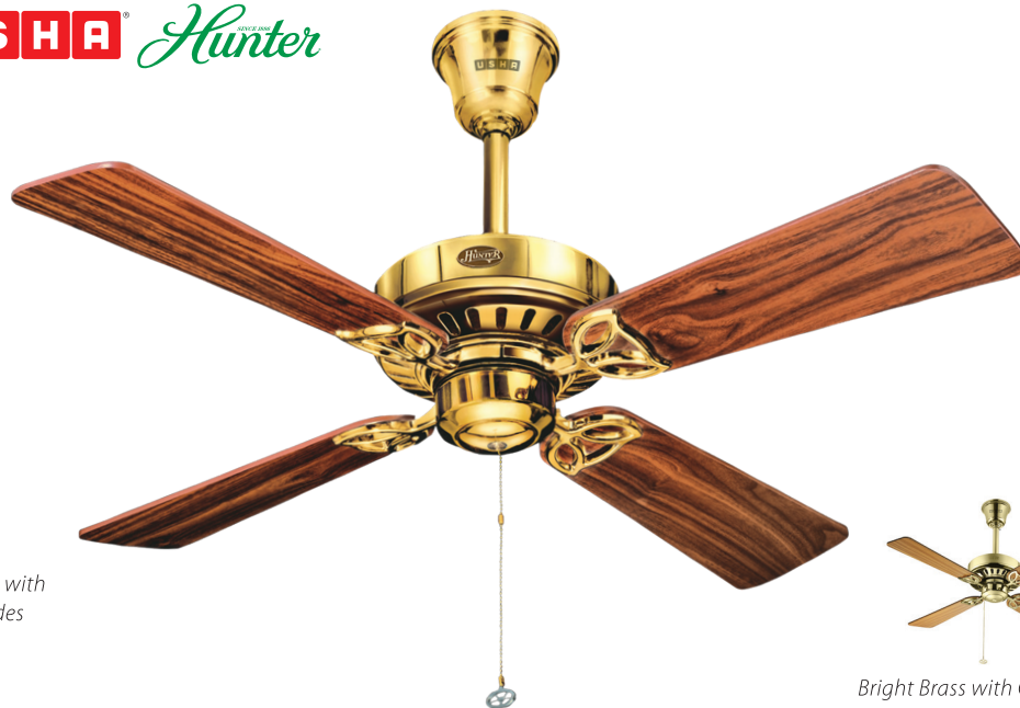
Bright Brass with Walnut Blades