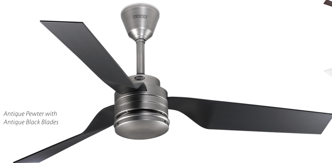
Antique Pewter with Antique Black Blades