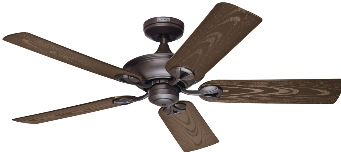
New Bronze with Walnut Blades