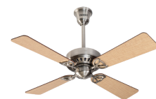
Brushed Nickel with Oak Blades