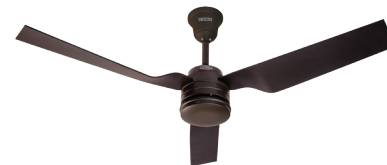
New Bronze With Coffee Beech Blades