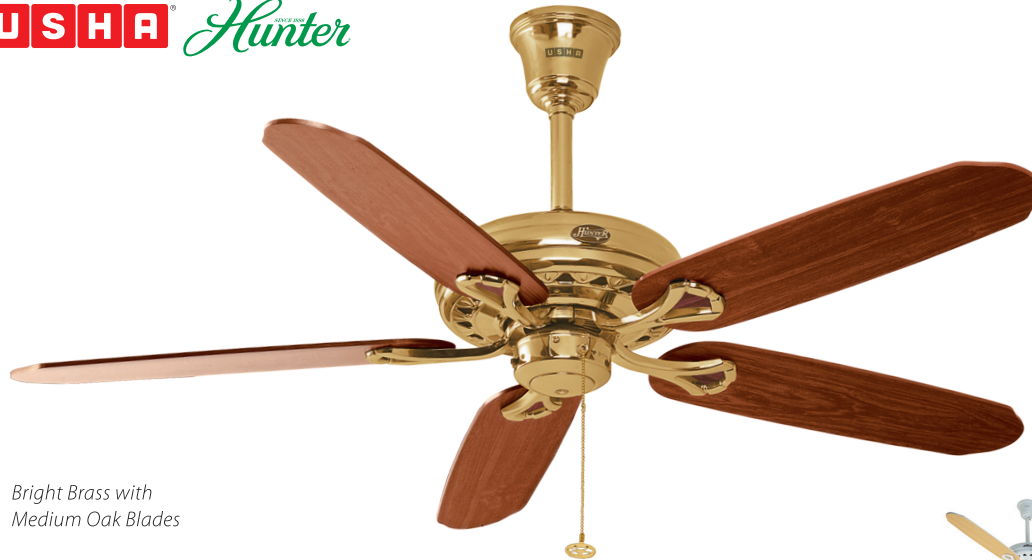
Bright Brass with Medium Oak Blades