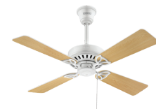
White with Oak Blades