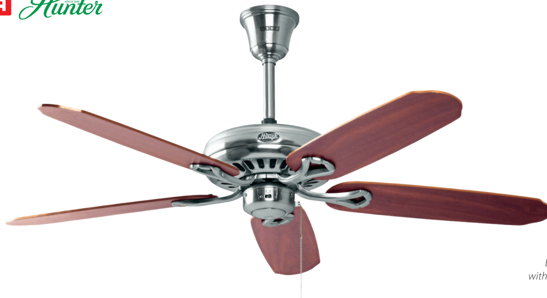
Brushed Nickel with Cherry Blades