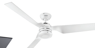
White with White Blades